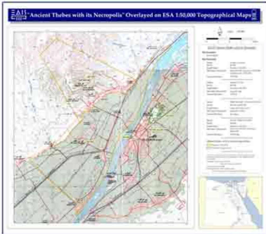
Boundaries of "Ancient Thebes with its Necropolis" overlaid on ESA 1:50000 topographical map

EAIS, the official GIS Centre of the SCA, provided the Heritage Centre with up-to-date maps for the SCA managed sites in Egypt.