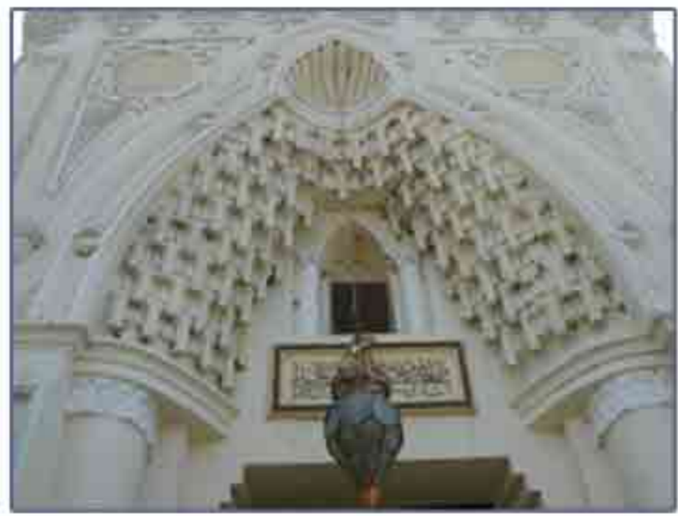
Decorated main entrance to the mosque

This mosque is currently under the SCA registration process, meaning that its protection is still undecided. As in the case of so many other religious structures in Egypt, modern and unprofessional restoration and rebuilding threaten to obliterate original features of the mosque.