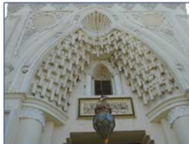
Decorated main entrance to the mosque

This mosque is currently under the SCA registration process, meaning that its protection is still undecided. As in the case of so many other religious structures in Egypt, modern and unprofessional restoration and rebuilding threaten to obliterate original features of the mosque.