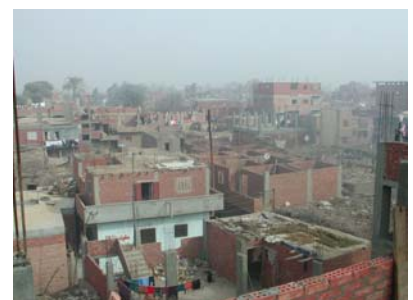
A PHOTO OF THE SOUTHERN PORTION OF TALL SAFT AL-HINNAH, SHOWING A VILLAGE COVERING THE SITE.

THE EAIS HAS COMPLETED ARCHAEOLOGICAL RESEARCH AND THE DRAWING OF VECTOR LINES FOR ANCIENT EGYPTIAN SITES IN THE GOVERNORATE OF AL-ISMA'ILIIYAH.