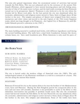
A SAMPLE OF THE QANTIR PAGE IN THE UPCOMING CAHIER ON THE GOVERNORATE OF ASH-SHARQIYYAH, WITH A MAP AND DATA DESCRIBING THE SITE.