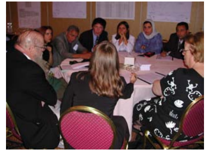
ARCHAEOLOGICAL MISSIONS AND INTERNATIONAL INSTITUTIONS DISCUSSING METHODS OF COLLABORATION DURING THE ROUNDTABLES.

The conference strengthened the EAIS's rapport with national and international institutions, opening channels of communication between the project, those who contribute to the preservation of historical material, and those who make the official decisions on the future of the legacy of Egypt's past. It allowed EAIS to build stronger ties within the SCA and with other governmental, educational and cultural institutions, helping to put crucial land use information at the hands of those who need it most: the officials, scholars, and professionals whose diverse contributions make historical site protection possible.